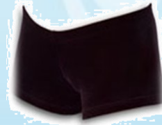
Black Micro velvet shorts: $17