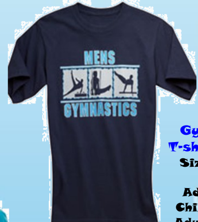
Men's Gymnastics T-shirt in blue Sizes: Child: XS-L Adult: S-XL Child: $14.95 Adult: $18.95