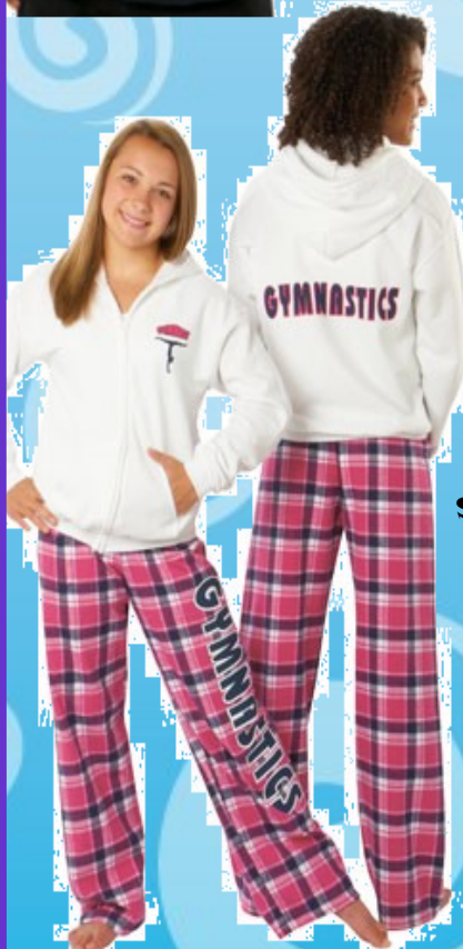
White Gymnastics Zip up: Sizes: Child S-L Adult: S-XL $31.95