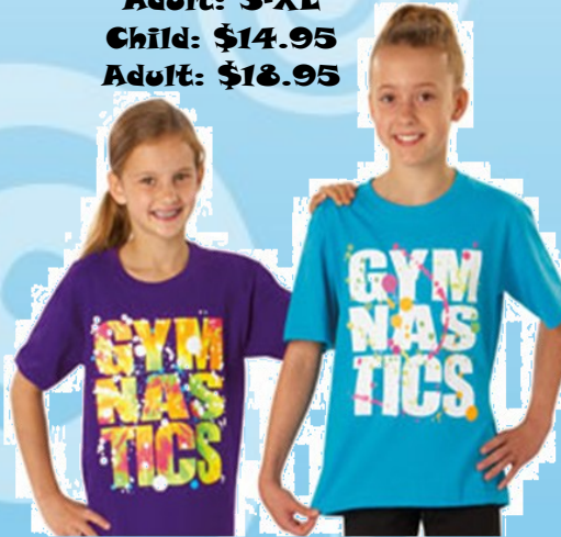
Splatter t-shirts in blue, purple, or black Sizes: Child S-L Adult: S-XL Child: $14.95 Adult: $18.95