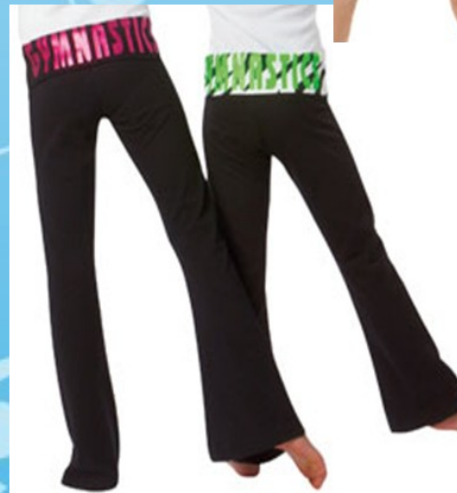
Gymnastics or Cheer yoga pants: Pick your waist-band! Sizes: Child: S-L Junior: XS-XL $29.95