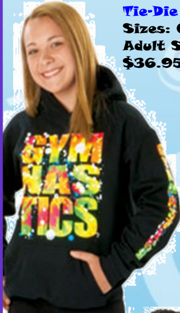
Tie-Die Hoodie: Sizes: Child: L Adult: S-XL $36.95